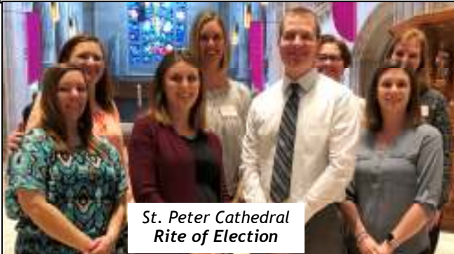
St. Peter Cathedral Rite of Election