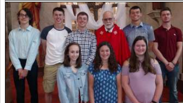
St. Mary Church High School Graduates